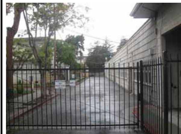
Subject property – Cressy Drive access.