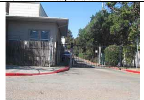
View of northerly property line of subject property, from McKay Avenue.