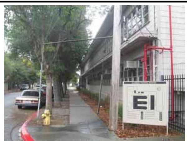
Southerly view of McKay Avenue, existing improvements, and a secondary gate and access identified as Cressy Drive.