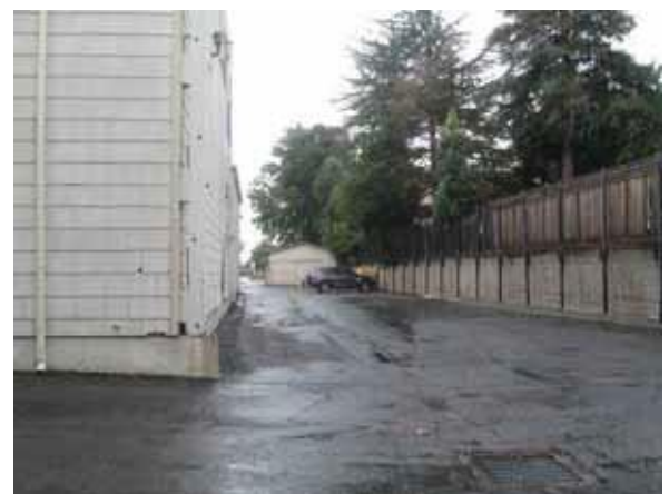
Southern view of the subject along the west property line, from the northwest property corner.