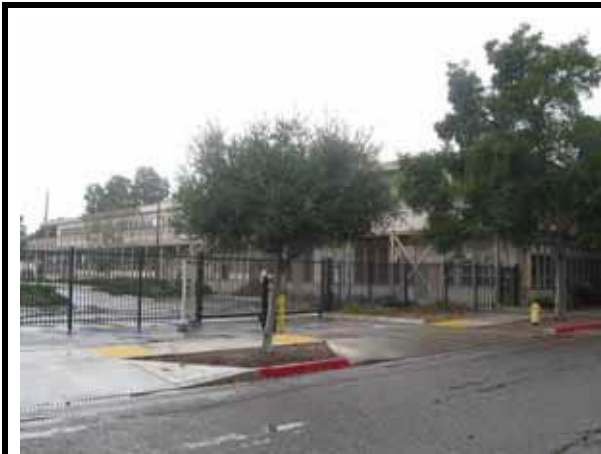
View of entrance to the subject property from McKay Ave. Southern portion of the subject property..